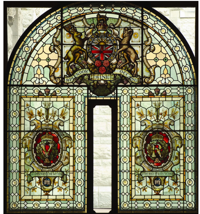
The Diamond Jubilee Window

One of the largest and most beautiful windows is the Queen Victoria Diamond Jubilee Window. Created by Powell Brothers Ltd. of Leeds, England, it celebrates the 60th year of the reign of Queen Victoria.